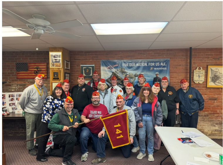
Our March meeting