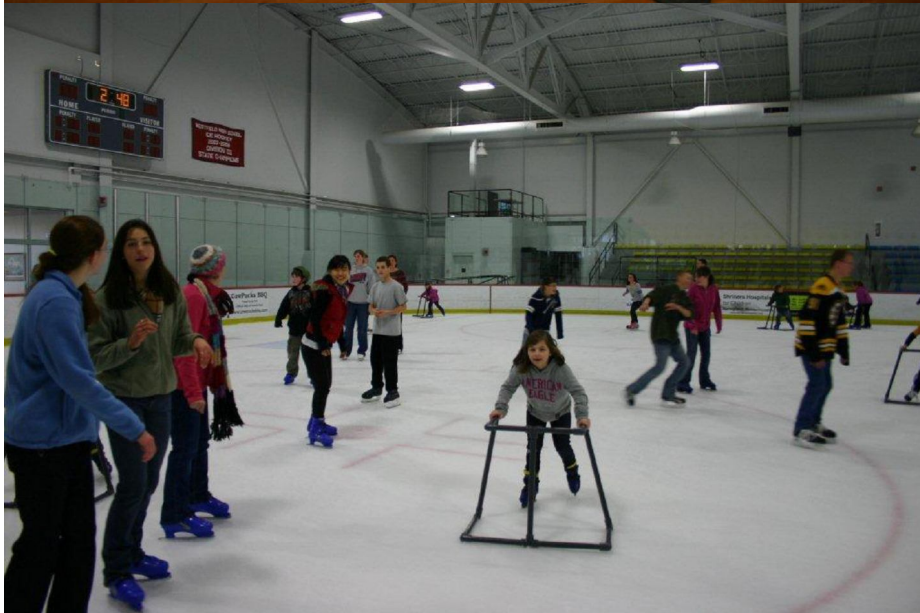
Kid's Skate Party at Amelia Skate Park