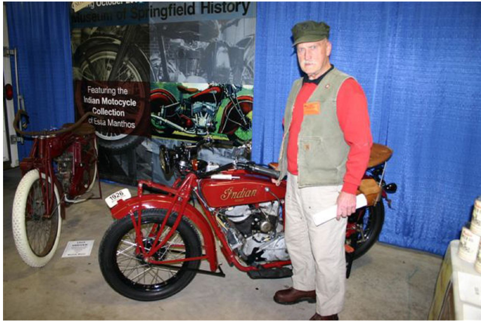
An oldie but goodie, the bike that is!