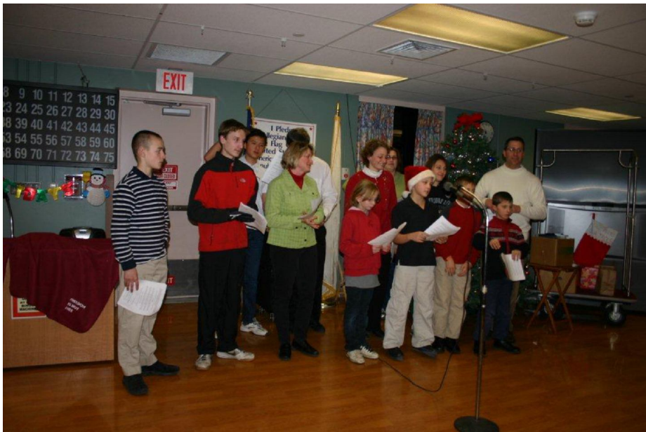
Christmas Choir at the Soldiers' Home