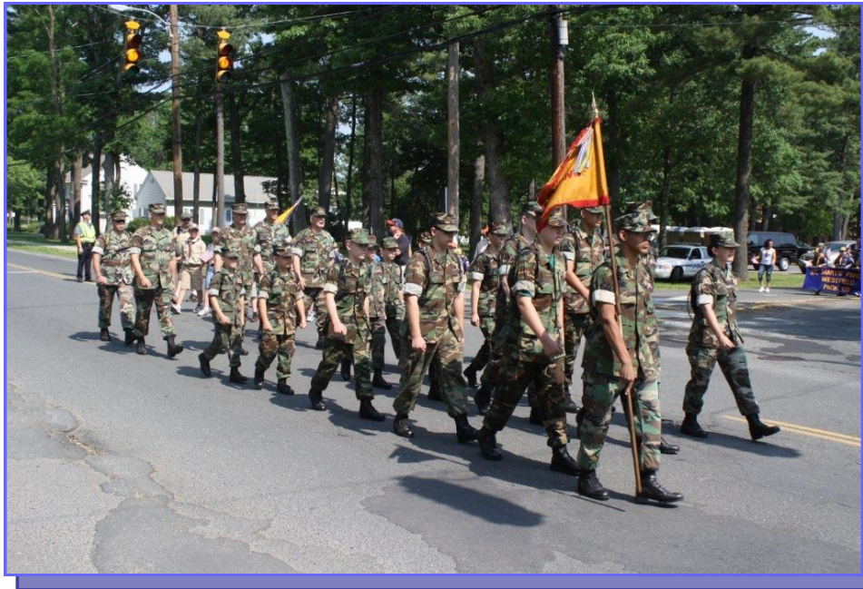
The Young Marines, Best marching unit again.