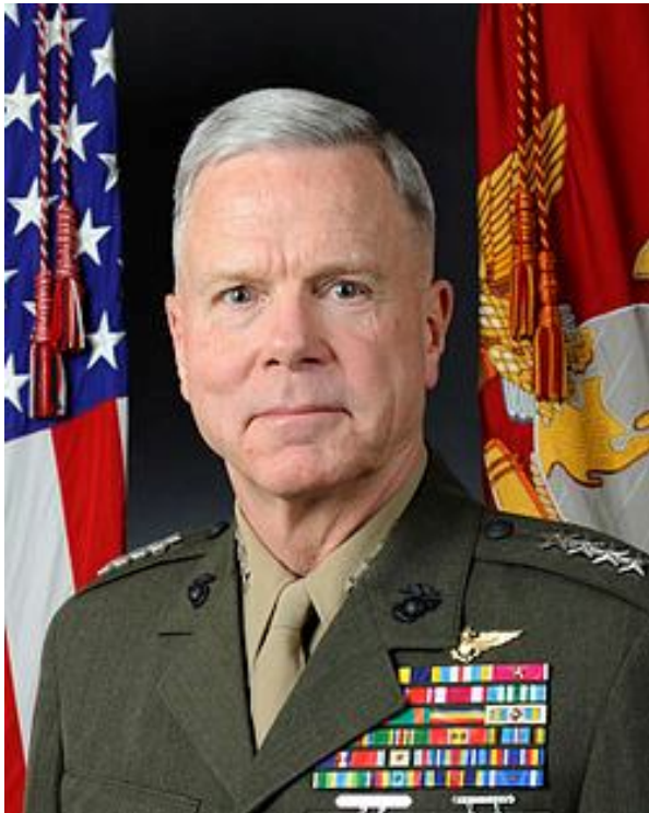
General James F. Amos 35th Commandant

Sixty years ago, the United States Marine Corps—as it has throughout our history—demonstrated its vital role as America’s Expeditionary Force in Readiness. Just weeks after North Korean Communist forces crossed the 38th Parallel, the First Marine Provisional Brigade landed in South Korea, forming the backbone of the perimeter around the city of Pusan. The efforts of the “Fire Brigade” at Pusan allowed for the daring amphibious landing at Inchon and set the stage for one of the most savage campaigns in our Corps’ history—The Chosin Reservoir. As we pause to celebrate our 235th birthday we pay special tribute to the Marines of the Korean War and recognize their contributions to our enduring legacy.