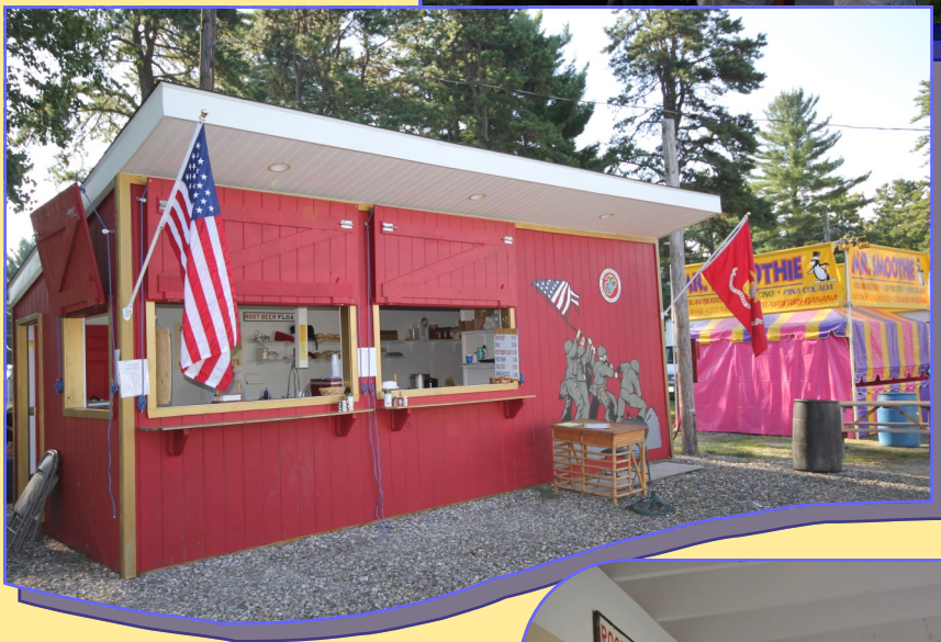
The calm before the storm

Preparing the baked potatoes is Auxiliary member Betty Boisseau, aka Sis. We ran out and sold over 400 baked potatoes for the weekend.